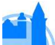
Leek High School